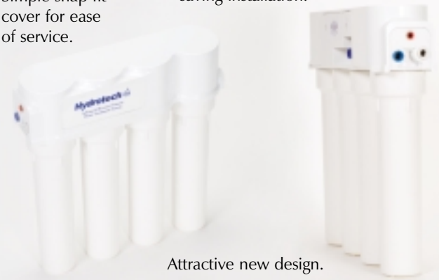
Attractive new design.

New slim profile with integrated mounting bracket for easy, space saving installation.